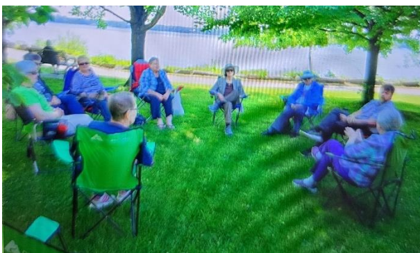
Coffee Group at Bell Park