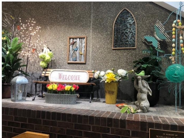
Spring planter in the Narthex