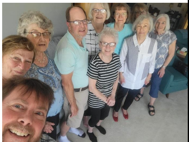
Connex Partners - having fun!