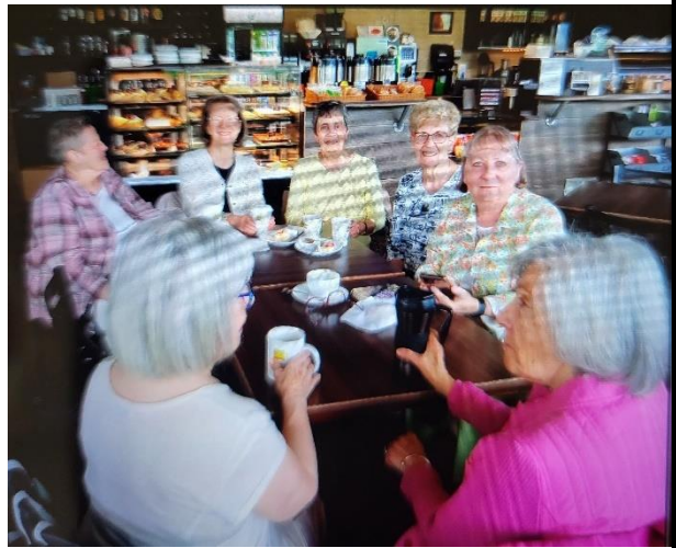
Monday Morning Coffee Group