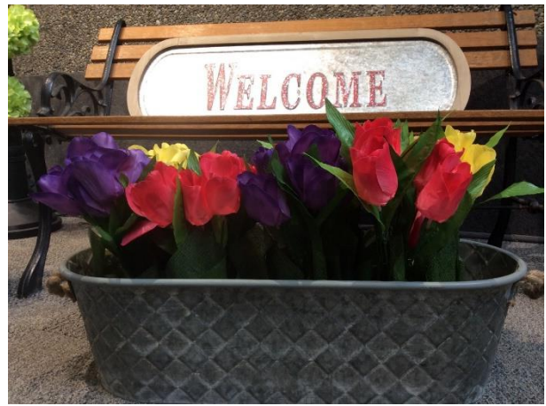
Welcome! Spring planter