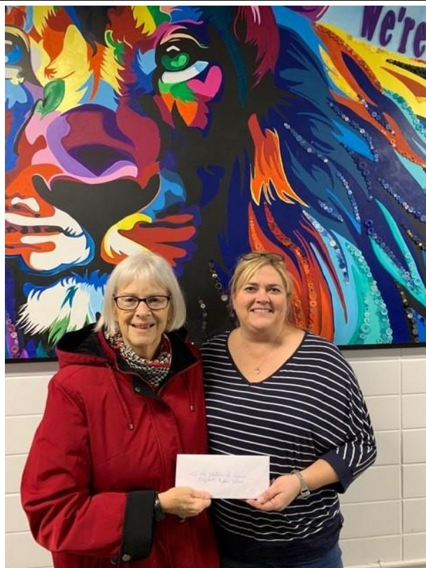
Children at the Centre Queen Elizabeth II Public School