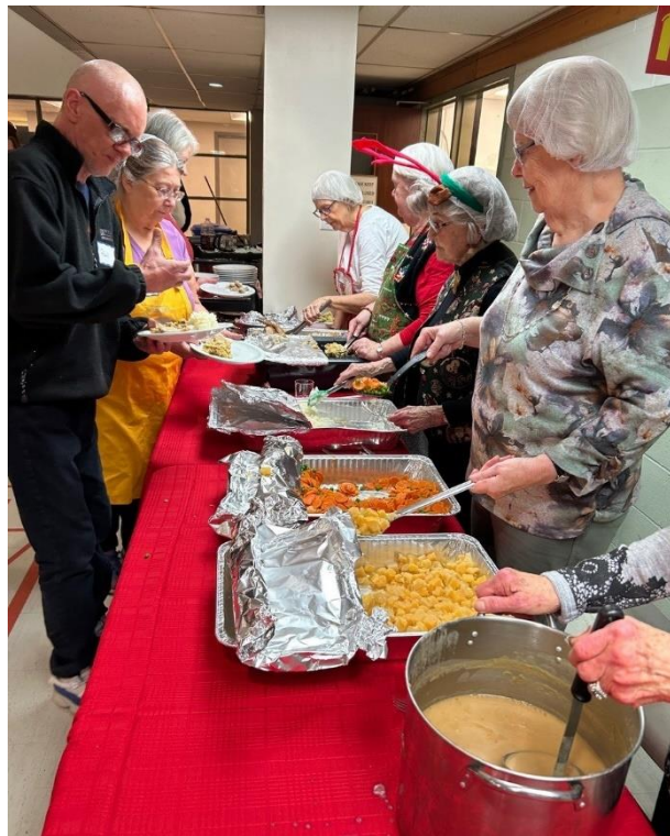
St. Andrew's Place Christmas Dinner