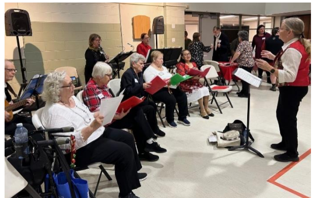
St. Andrew's Place Christmas Dinner