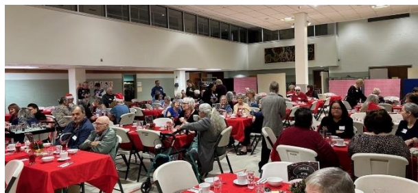
St. Andrew's Place Christmas Dinner