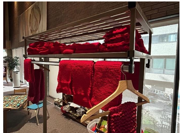
Red Scarf Campaign