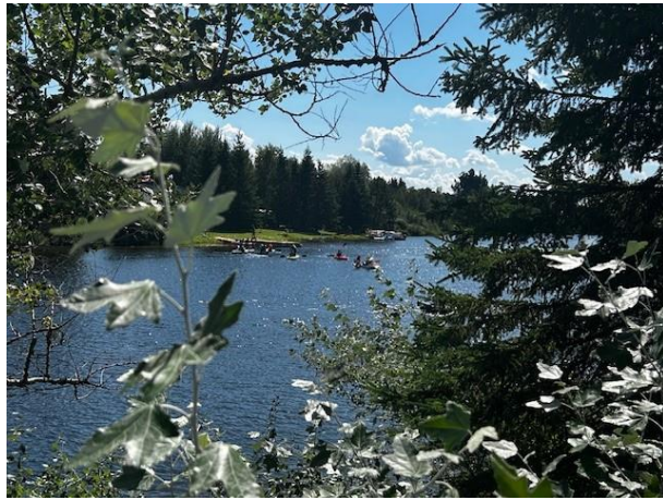
Deb McIntosh - Wahnipitae River