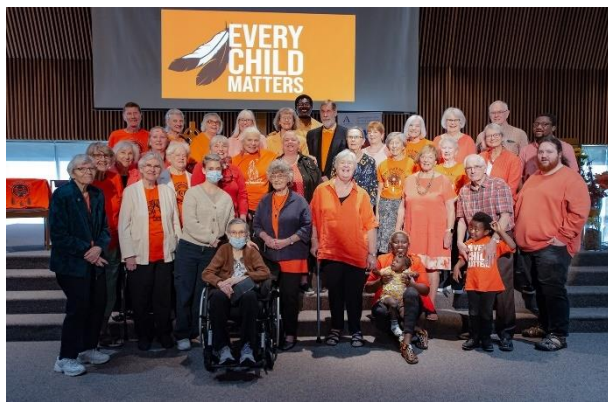
Orange Shirt Day