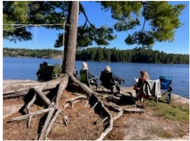
Deb McIntosh - Wahnipitae River