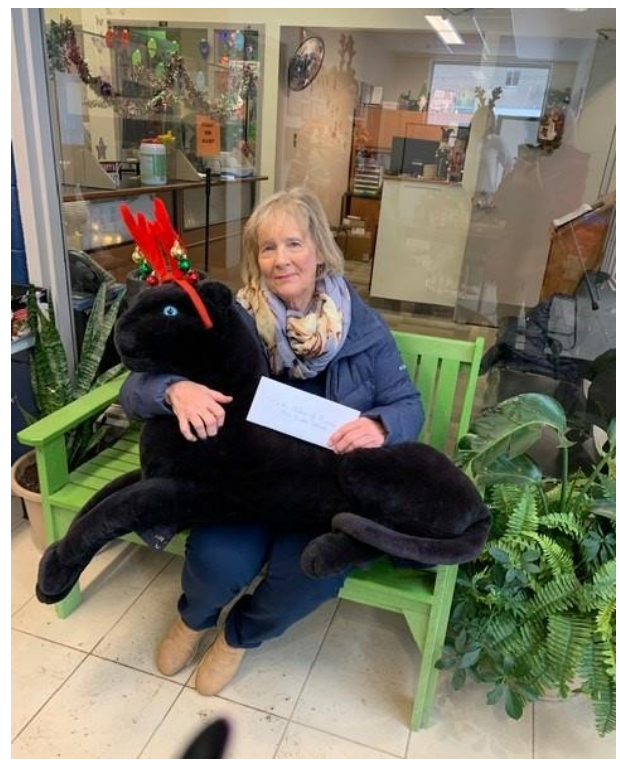
Children at the Centre Lansdowne Public School