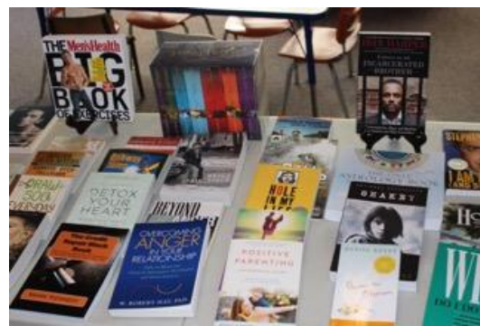
April: Lenten Library Project