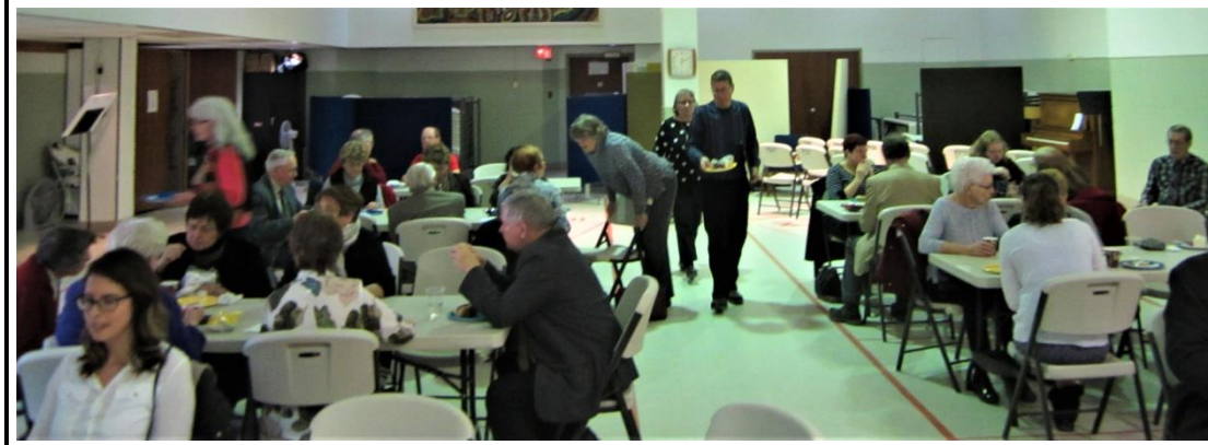
January Hot Dog Lunch