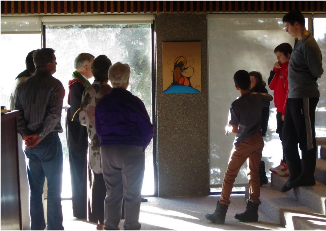
January: Installation of Art from Manitou Conference