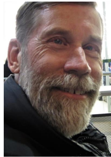
Feb: Coldest Night of the Year