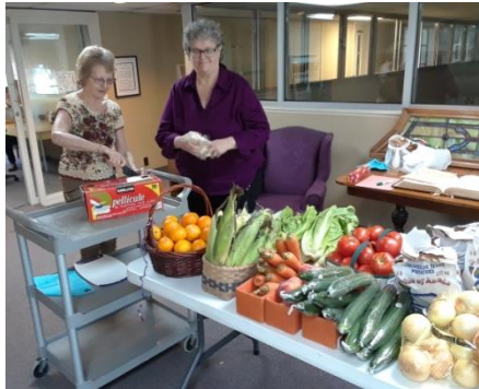
September: Veggie Giveaway