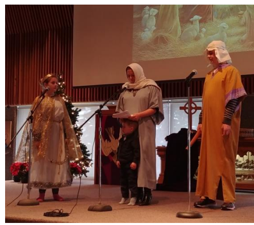
December: Christmas Pageant