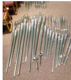
June: Dismantling the organ