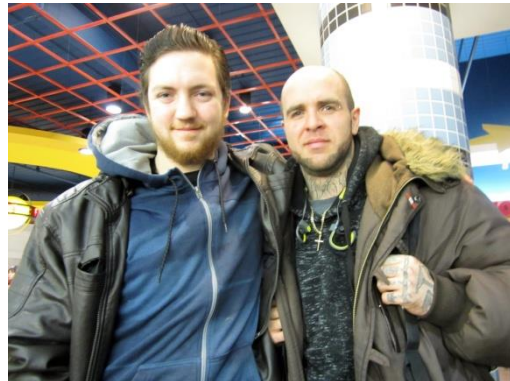
Coldest Night of the Year