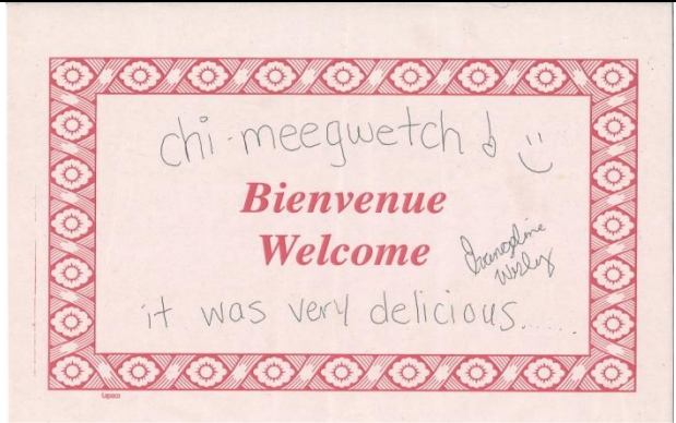
Thank you note from OOTC guest.