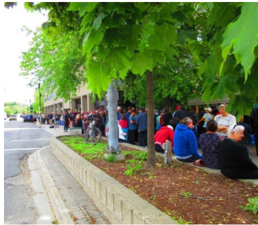
June: Downtown Churches Barbeque - Look at the line-up!