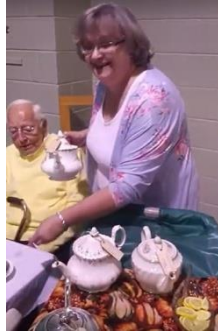
September: Afternoon Tea