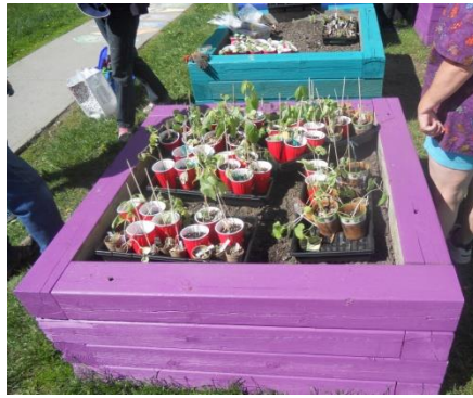
June: Louis Street Community Garden