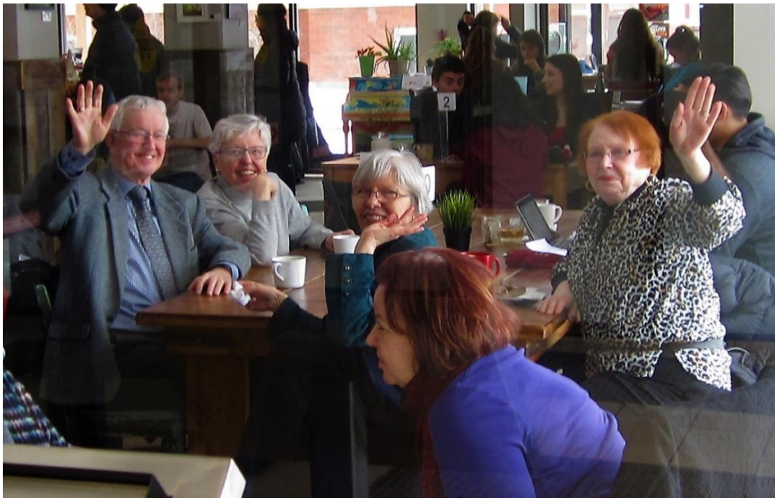
January: Lunch at Kuppajo.