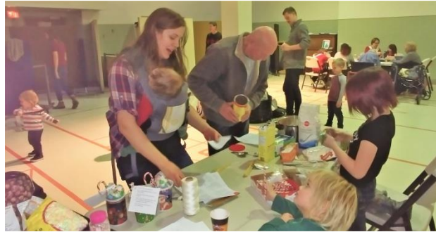
December: Family Advent Event