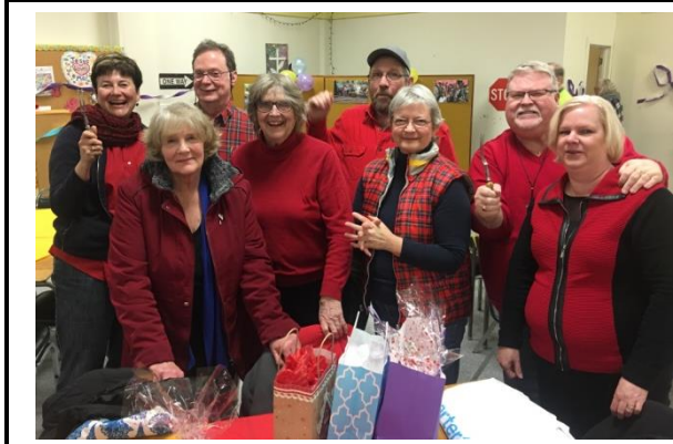
March: Winning Trivia Team!!