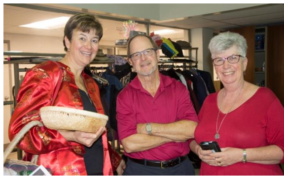
Back from China!