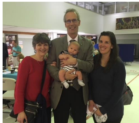
May: Grandma and Grandpa!