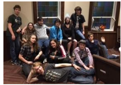
October: Niagara Youth Festival - and yes, that picture is upside-down on purpose! ☺