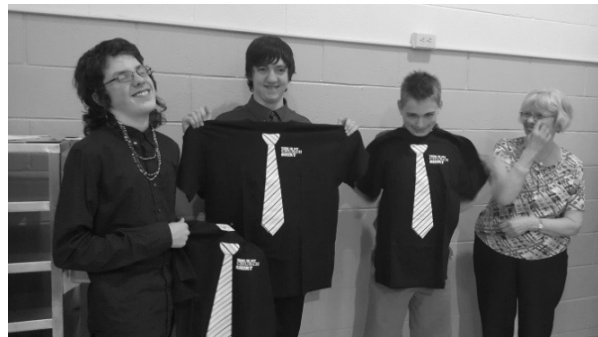
Faithjourney, May 2015