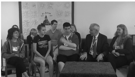
Manitou Youth Conference, May 2015