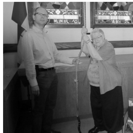
Ringing the bell in recognition of lost Aboriginal women, June 2015