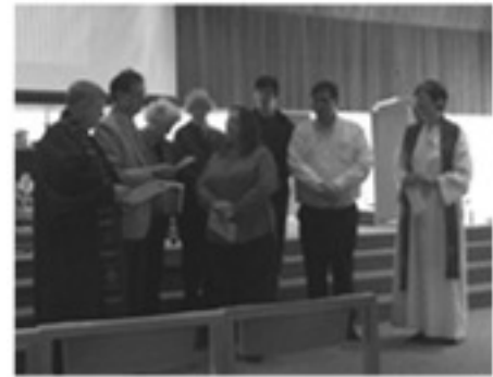
Receiving a new member, March 2015