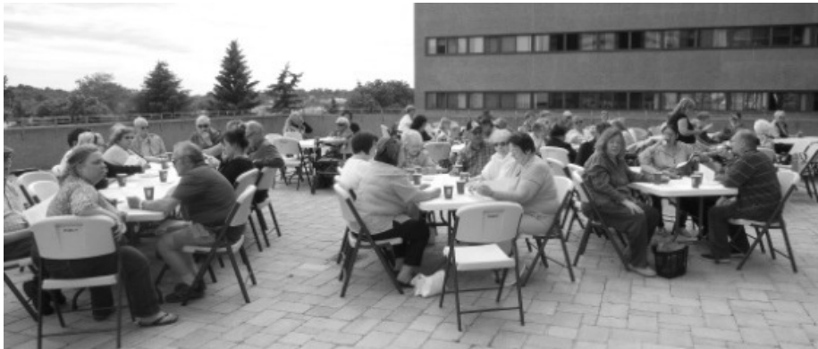
Body & Soul rooftop BBQ, June 2015