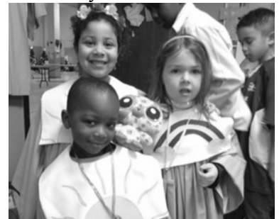
Let little children come unto me.