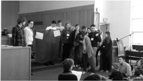
Worshiplude, January 2015