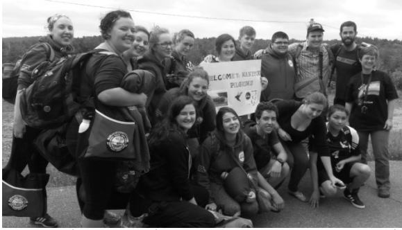
General Council 42 Cross-Country Youth Pilgrimage, July 2015