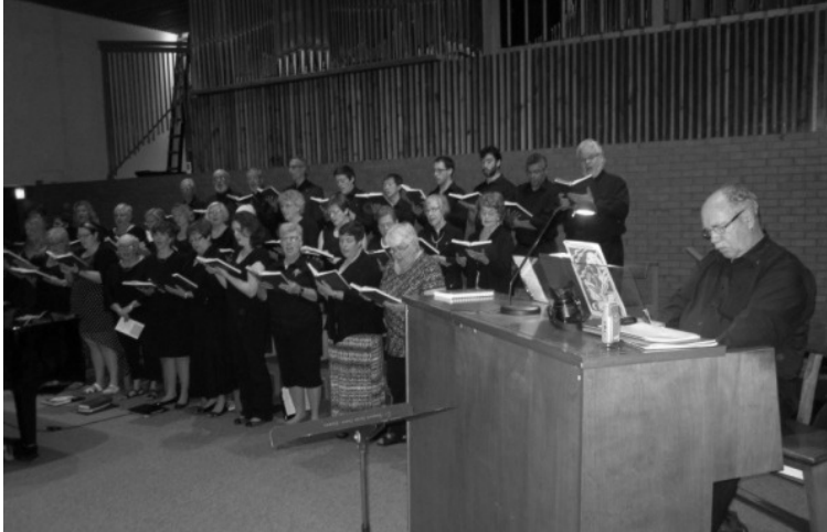
UCC 90 th anniversary choir, June 2015