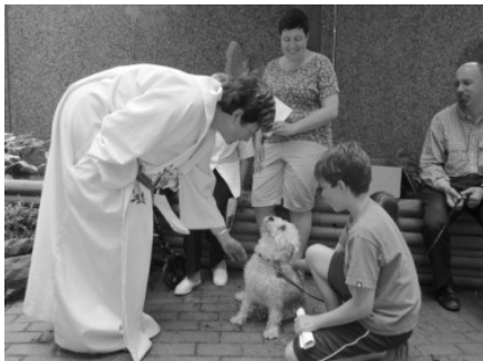
Pet Blessing, June 2015