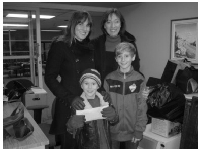
Generous support for our Syrian family from children in the community.