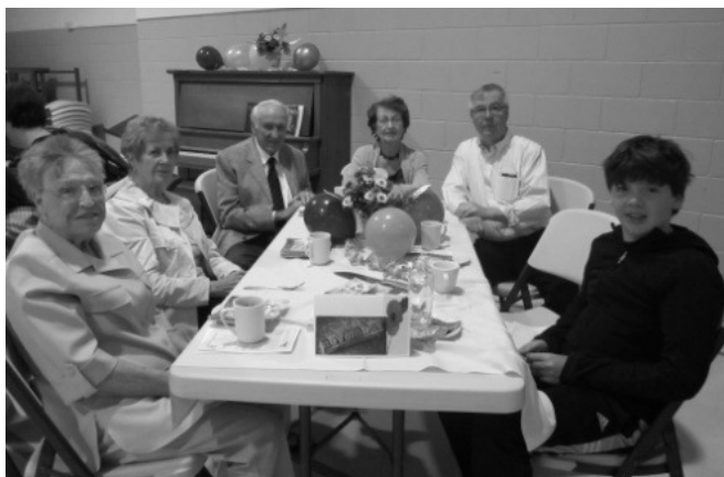
Congregational Birthday Party, May 2015