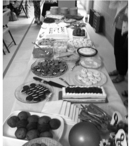
90 th anniversary, June 2015