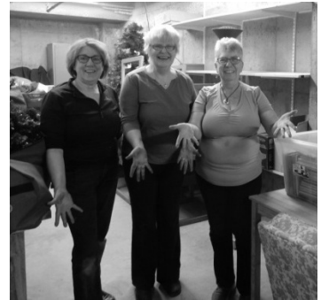
Busy worker bees!