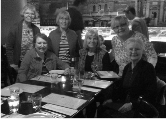
Annual "defunct" St. Andrew's Membership & Visitation "gals" get-away, September 2015