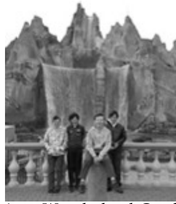
Youth trip to Wonderland, October 2015