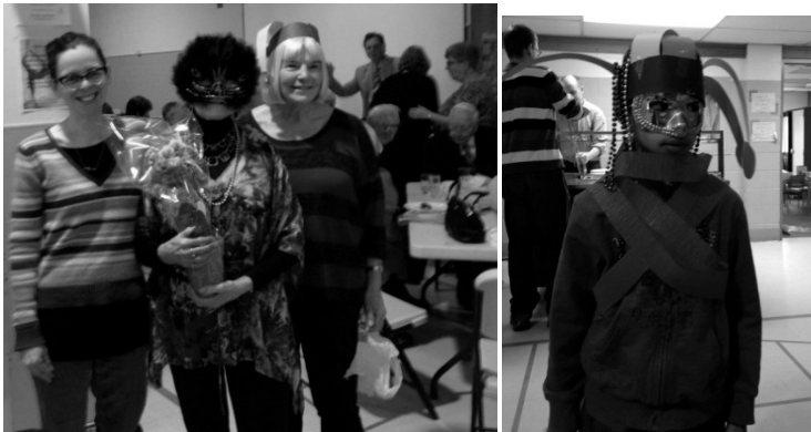
Mardi Gras, February 2015