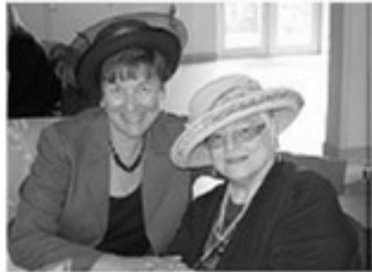
Lovely hats, lovely ladies!