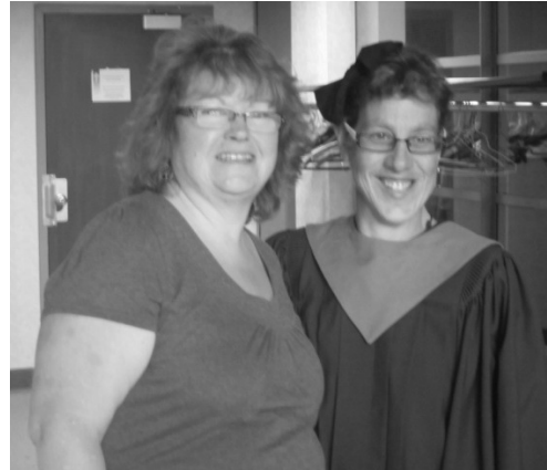
Another new member! December 2015