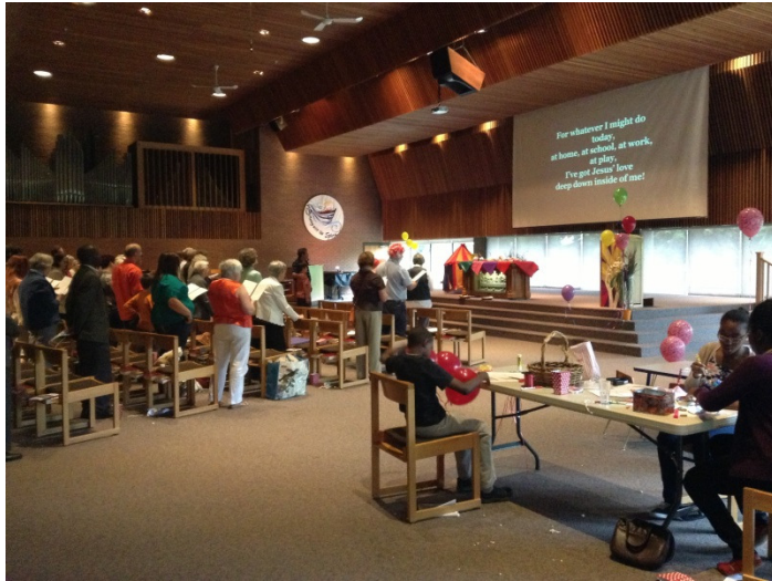
"Messy Church" Morning at the Circus, June 2013

St. Andrew's United Church, 111 Larch St, Sudbury ON Email: standy@cyberbeach.net Phone: 671-0721 www.st-andrews.com