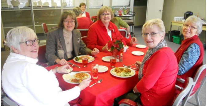
This table had some luck with door prizes!