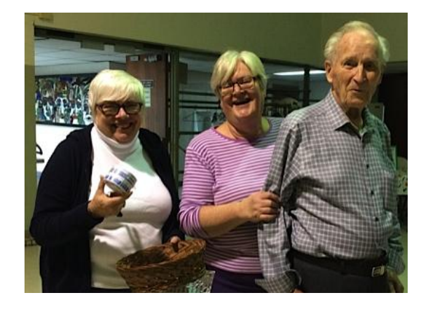
Thanks to everyone who helped make the Gifts Galore Raffle a great success!