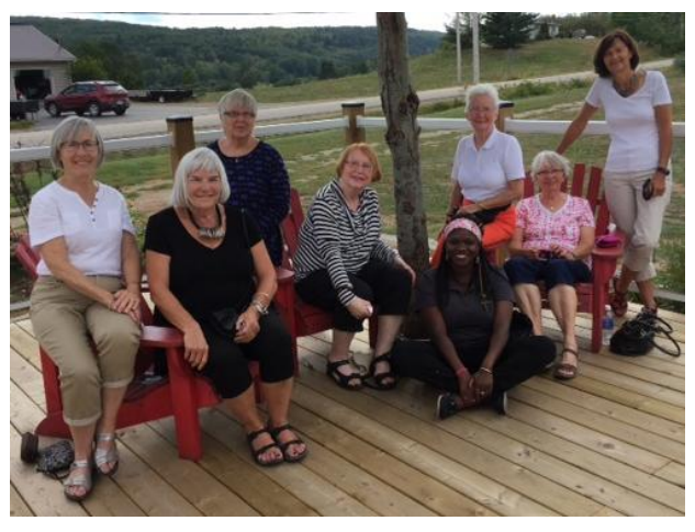
Annual "defunct" St. Andrew's Membership & Visitation "gals" get-away, September 2016.