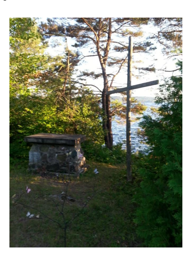
Family Camp, August 2016